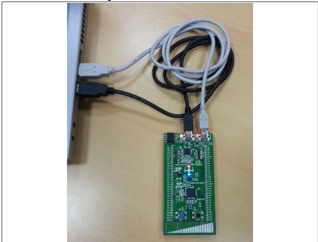
Figure 2. Hardware environment

Check jumper positions on the board, JP2 and CN5 are set to ON (Discovery mode).