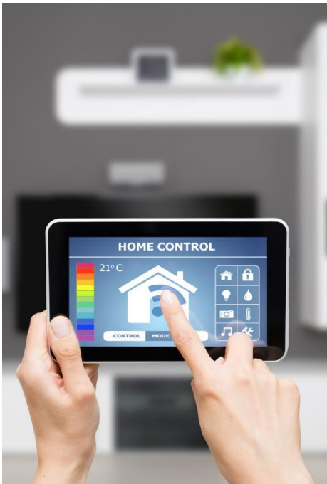
Smart Home & Building