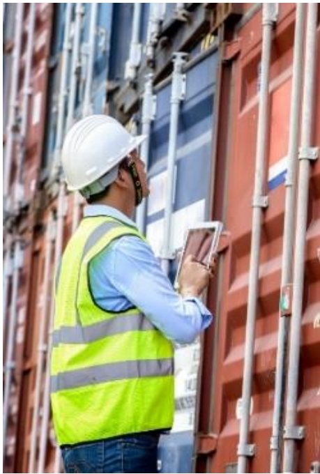
Transport & Logistics