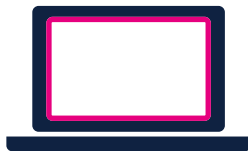
STSW-IFAPGUI software on PC