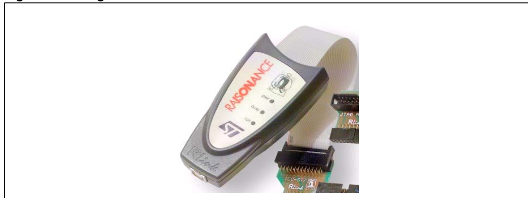
Figure 3. Target connection

ST has developed a target connection tool with Raisonance. This tool is powered from the USB port of the PC and connects to the JTAG port of SPC56x.