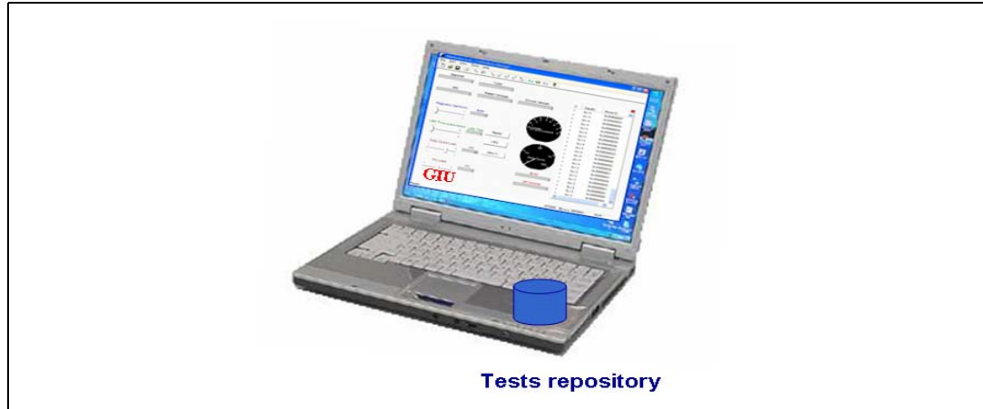
Figure 2. Test repository

Self tests are functional tests downloaded into the RAM of the target MCU.