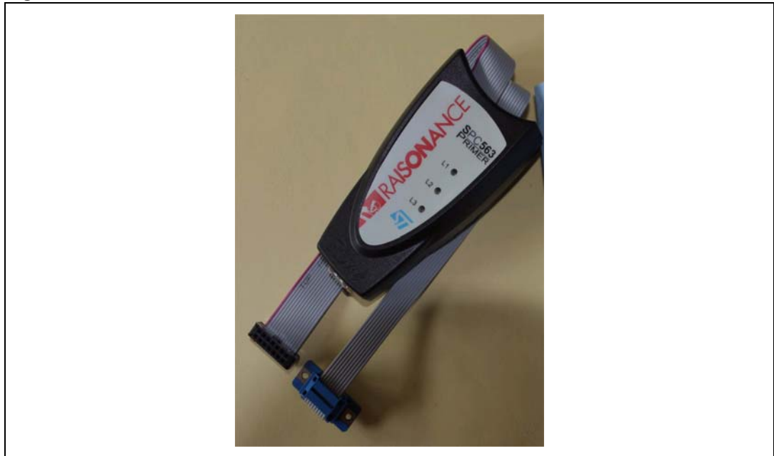
Figure 5. Combox

The usage of the Combox shall be limited to reading traceability information.