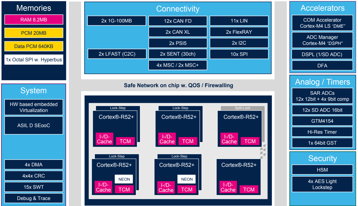
Figure 1. Block diagram

The figure below shows the top-level block diagram.