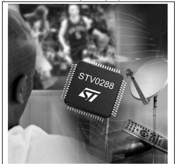
Figure 1. Package (TQFP64 with non exposed pas)

The device operates up to 120 MHz and can process variable modulation rates, up to 60 Mpsps. The chip outputs MPEG transport streams and interfaces seamlessly to the packet demultiplexers embedded in the ST Omega chip family. Its low power consumption, small package and low bill of material makes it perfect for all satellite applications.