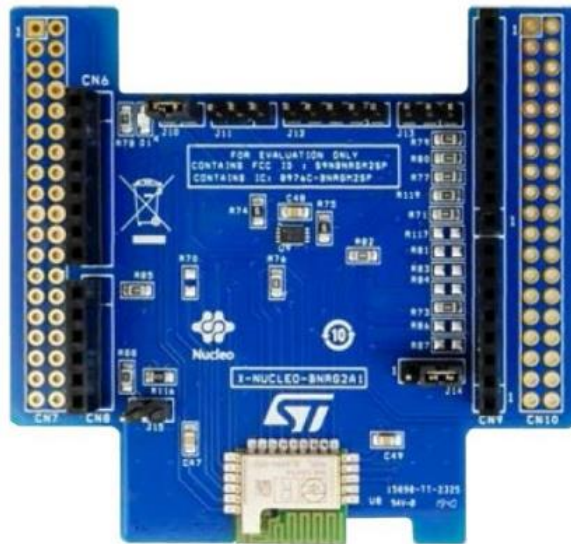
Figure 3 X-NUCLEO-BNRG2A1

When the X-NUCLEO-BNRG2A1 is used, the primary mode of operation of the integrated BlueNRG-2 chipset is Network Co-Processor. This means that the BlueNRG-2 device runs the BLE stack only, while the user's application is implemented and runs on the STM32 microcontroller on the Nucleo board. Note that the X-NUCLEO-BNRG2A1 could work as a standalone board in case VDD is supplied from an external source, even though this is not its primary mode of operation.