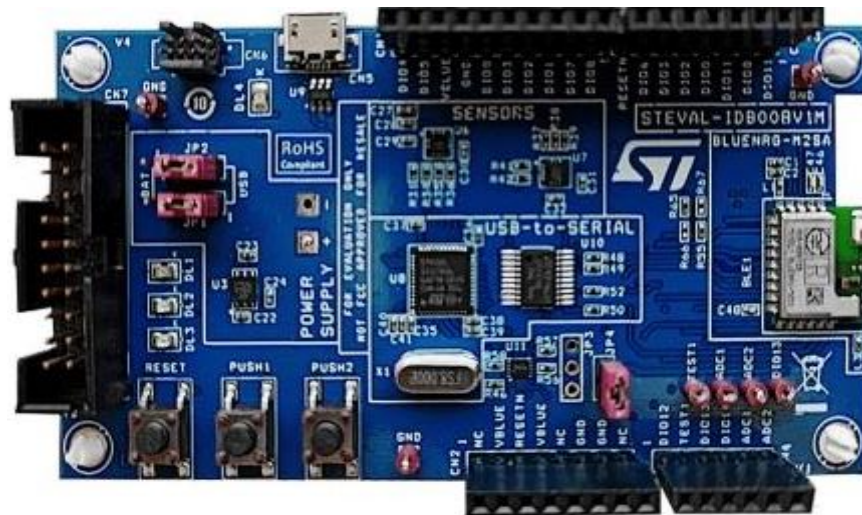
Figure 2 STEVAL-IDB008V1M

In the product evaluation phase, concerning the BlueNRG-M2SA, ST recommends the STEVAL-IDB008V1M evaluation board (Figure 2). The related SDK is named STSW-BLUENRG1-DK (the same SDK used for the BlueNRG-2 and BlueNRG-1 chipsets). When working with the STEVAL-IDB008V1M and the STSW-BLUENRG1-DK, the primary aim is to use the integrated BlueNRG-2 device (and therefore the BlueNRG-M2SA module) as the system processor running the user's application.