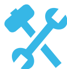
PC SW tools