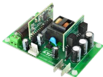
EVLG599-250WLLC STNRG599 + MASTERGAN1L + SRK2001A

ST offers a complete development ecosystem with ready-to-use reference designs and evaluation boards as well as helpful technical documentation.