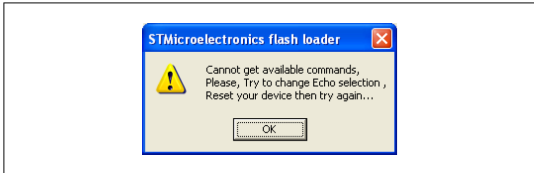
Figure 3. Dialog message if experiencing problems when trying to connect to the device with the Flash loader demonstrator