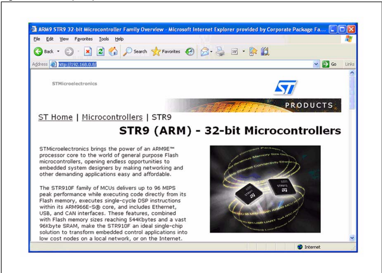
Figure 3. STR9 (ARM) - 32-bit microcontrollers