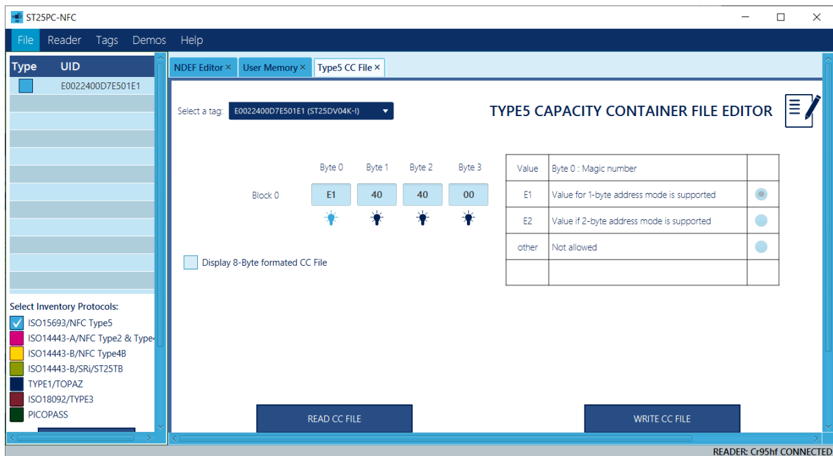
Figure 2. CC content example screen for ST25DV04K