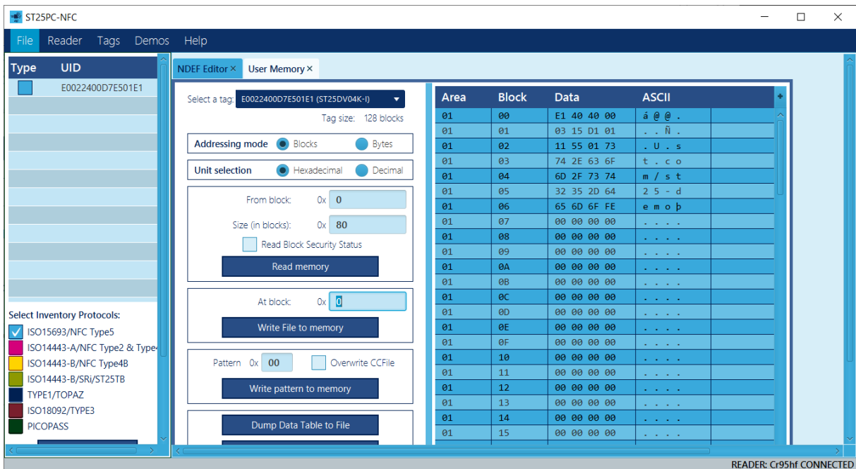
Figure 4. User memory content example screen for ST25DV04K