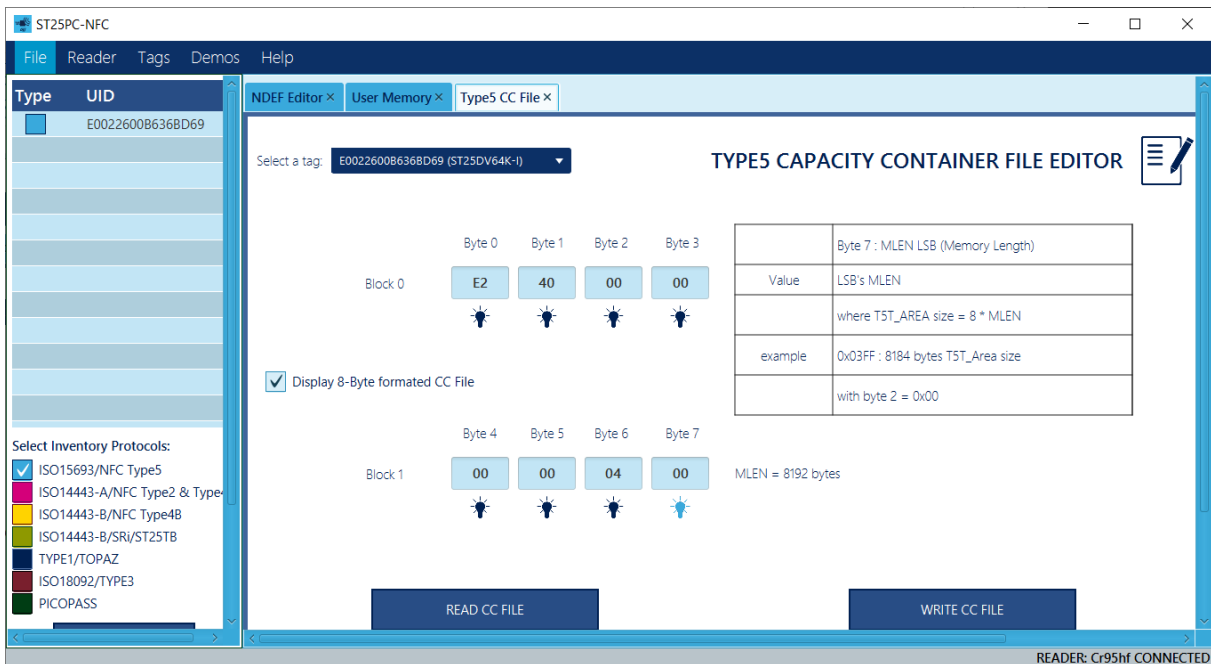
Figure 5. CC content example screen for ST25DV64K