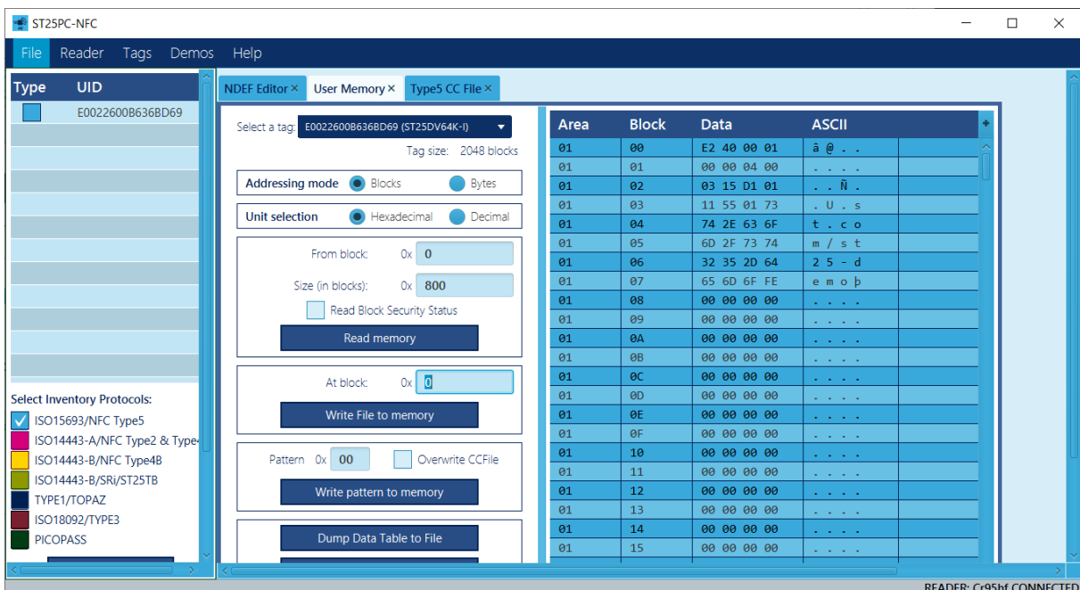
Figure 6. User memory content example screen for ST25DV64K